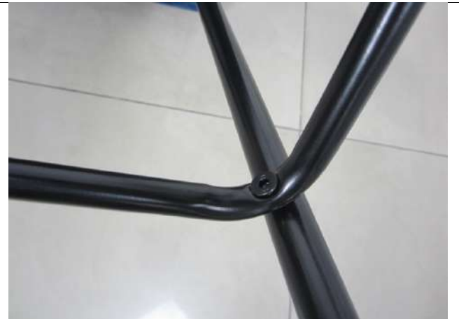
Item CH2157A (8)