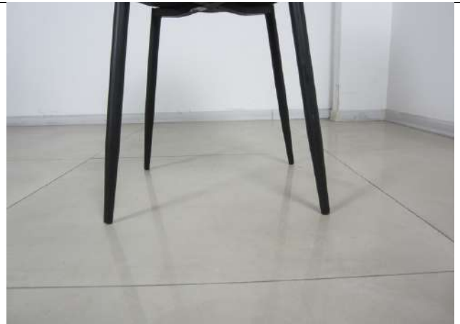
Item CH2163 (6)