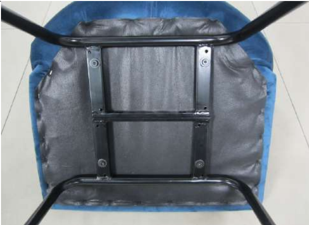
Item CH2157A (9)