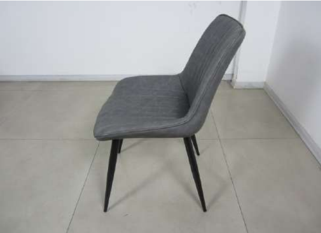
Item CH2152A (3)