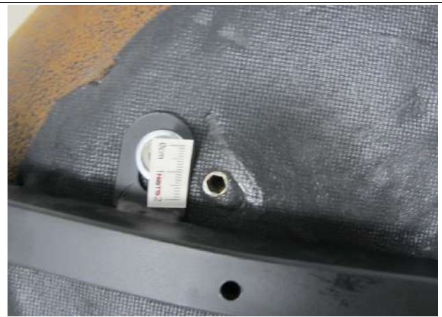
Defect- Item CH2163-Extra screw holes+extra sticker+Scratches mark on leg(2cm)-Ma