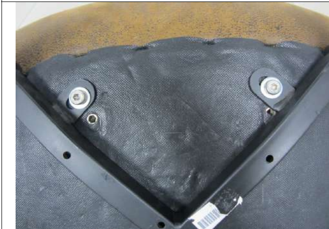
Item CH2163 (9)