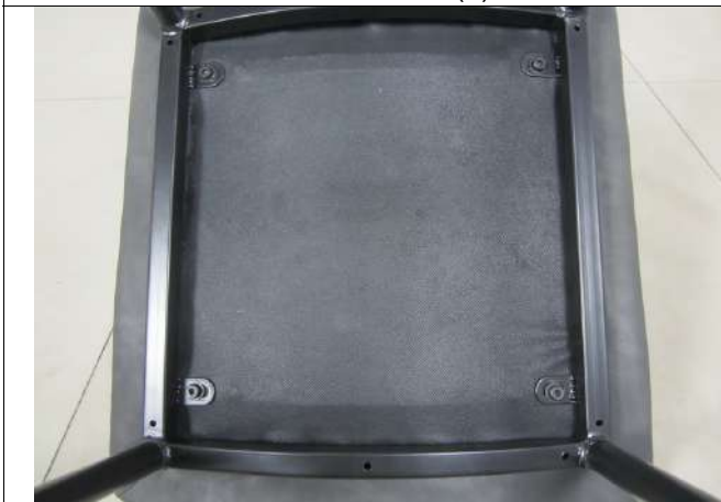
Item CH2154A (9)