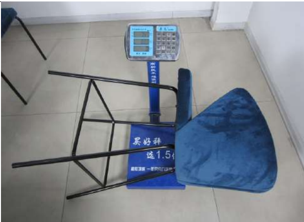
1 Product weight check