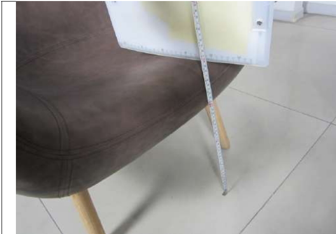
9 Product dimension check