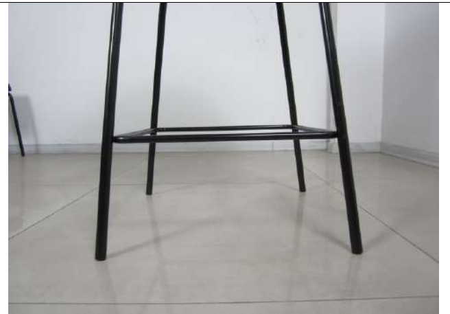
Item CH2157A (6)