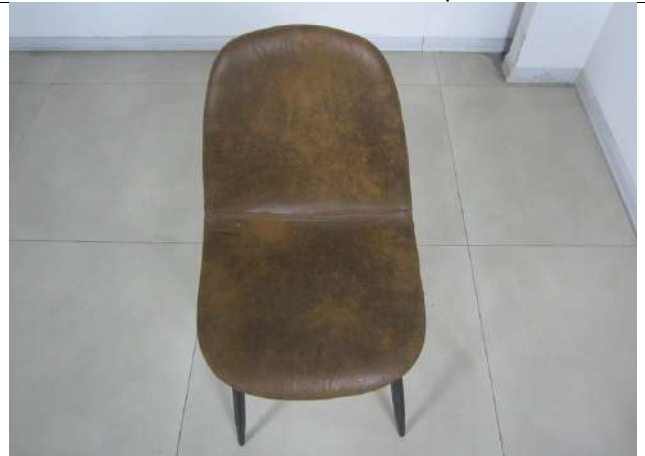
Item CH2163 (2)