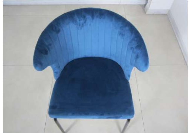
Item CH2156A (2)