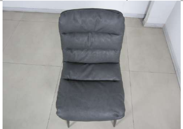
Item CH2154A (2)