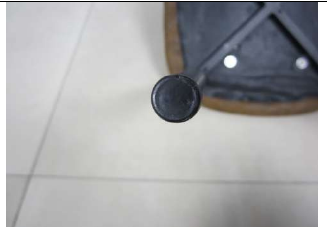
Item CH2163 (10)