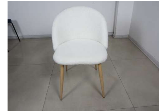
Item CH2164 (1)