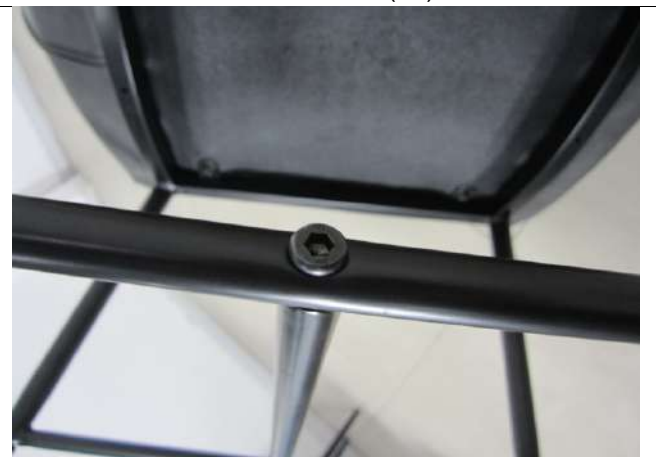
Item CH2154A (12)