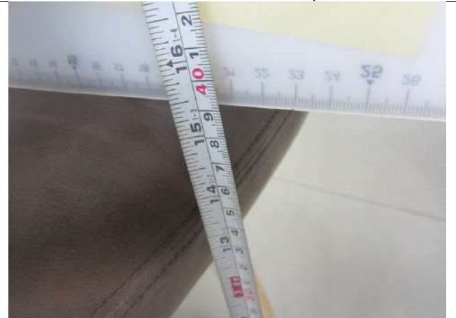
10 Product dimension check