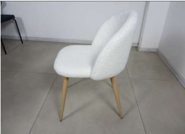
Item CH2164 (5)