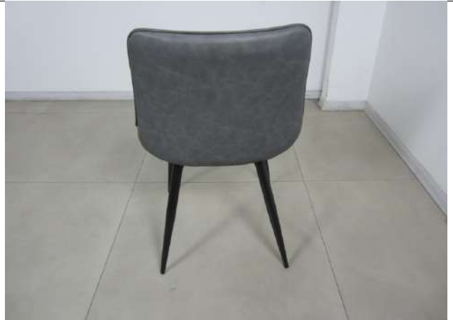
Item CH2152A (4)