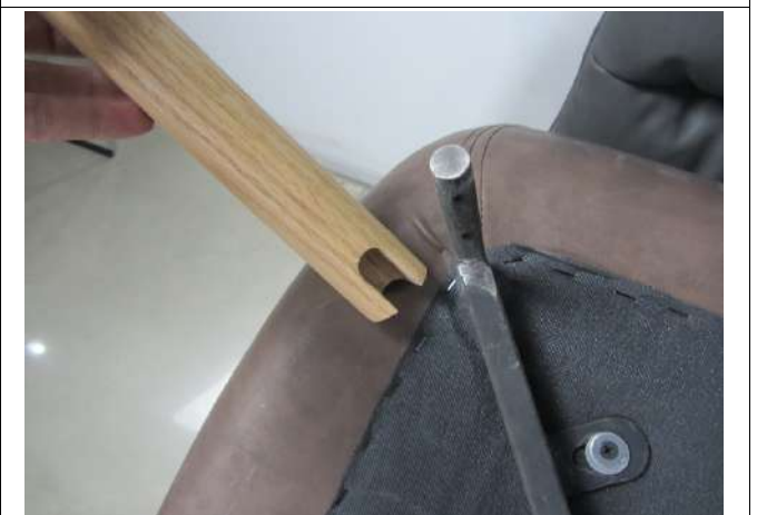
SAP2.1 Actually found