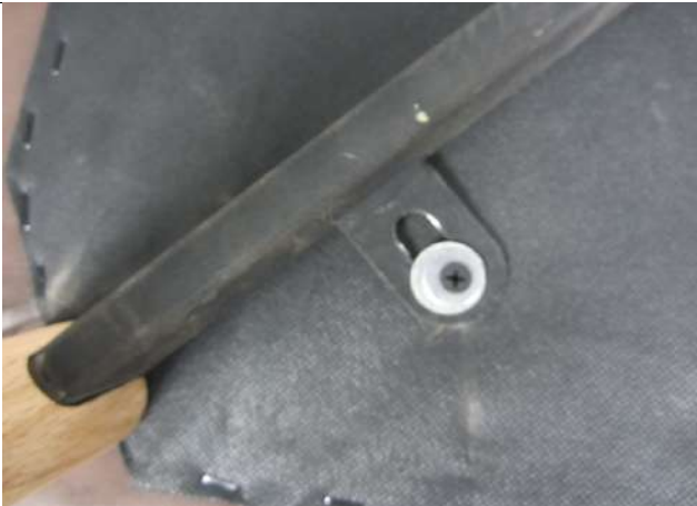
Item CH2151A (9)