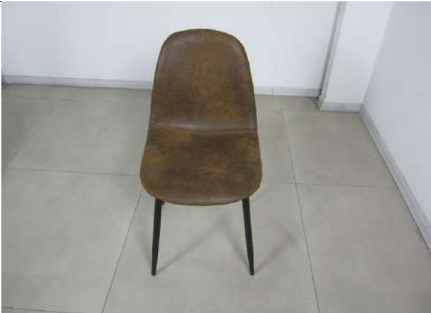
Item CH2163 (1)