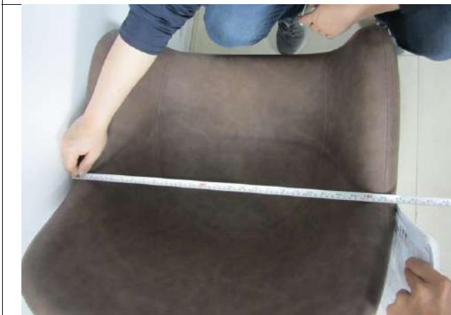
7 Product dimension check