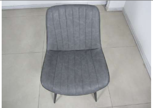
Item CH2152A (2)