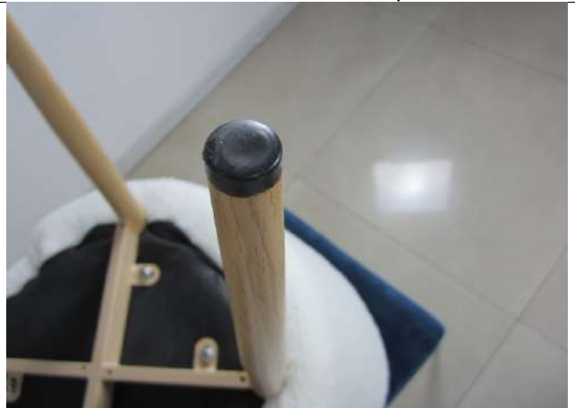
Item CH2164 (10)