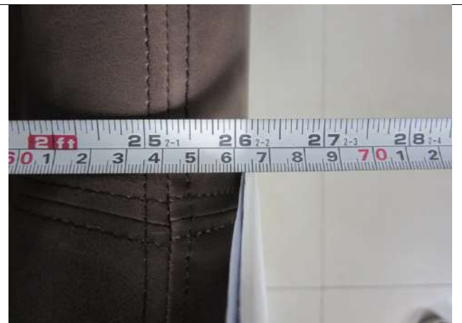
8 Product dimension check