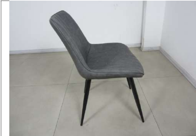
Item CH2152A (5)