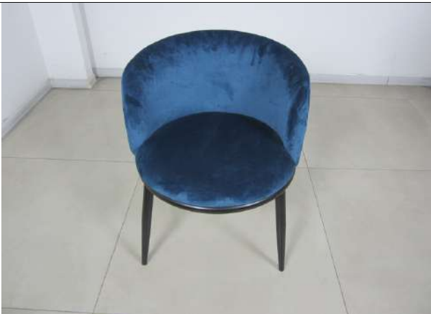
Item CH2161A (1)