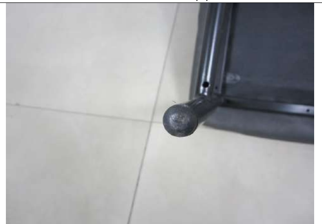
Item CH2154A (10)