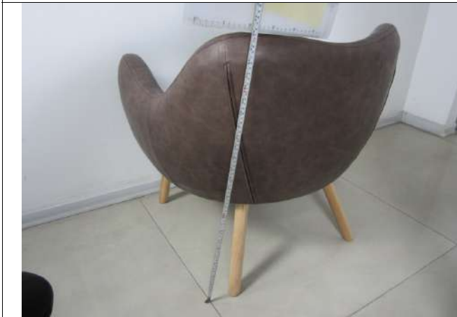
5 Product dimension check