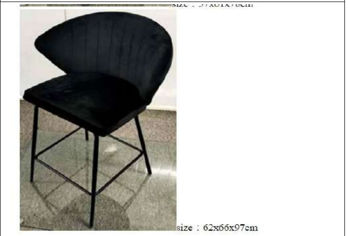
SAP1.2 On SPEC