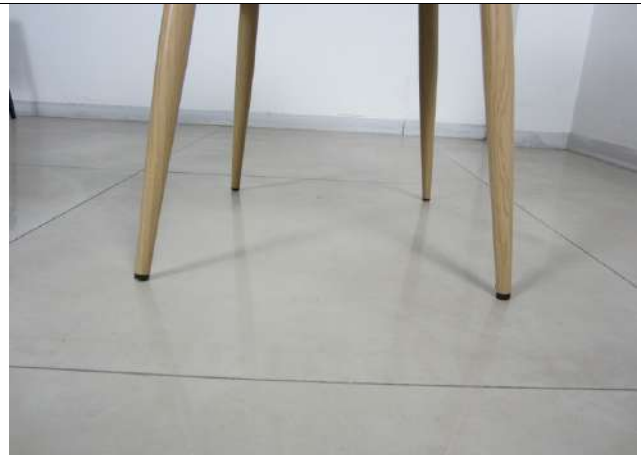
Item CH2164 (6)