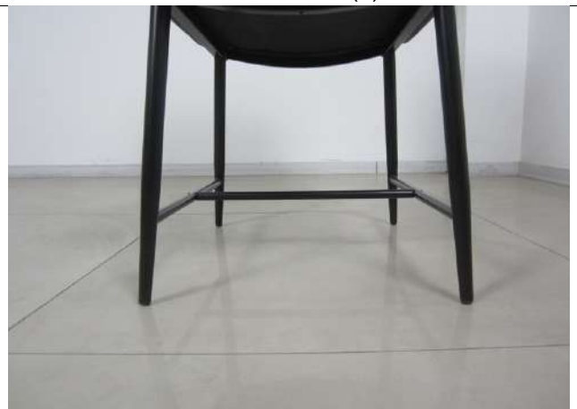
Item CH2154A (6)