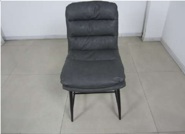
Item CH2154A (1)