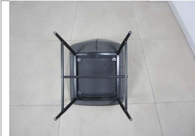
Item CH2154A (7)