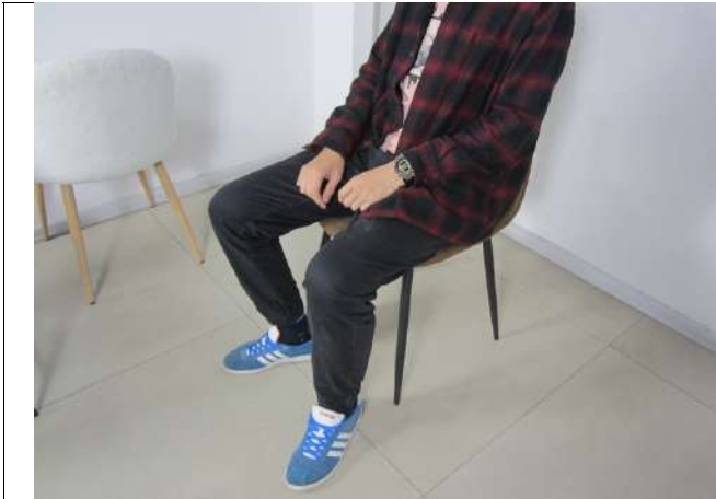
15 Real function operating check