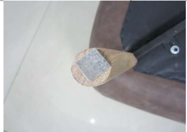
Item CH2151A (10)