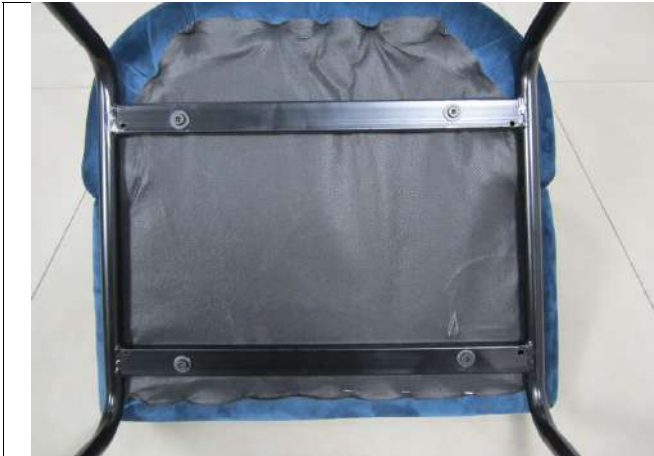
Item CH2156A (7)