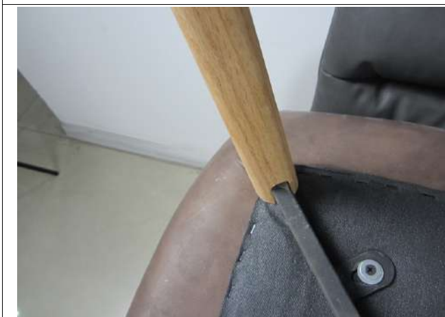
SAP2.1 Actually found 1