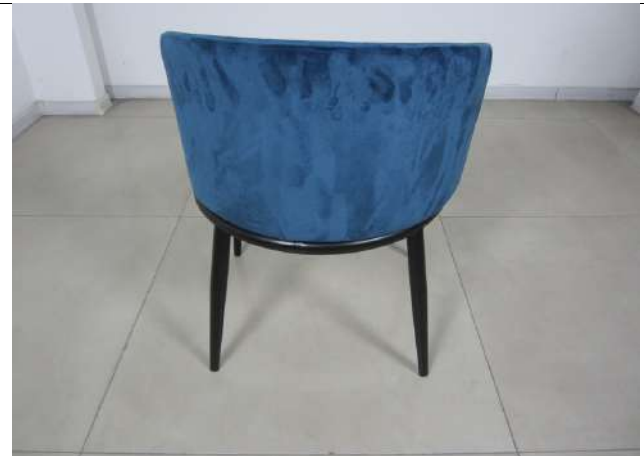
Item CH2161A (4)