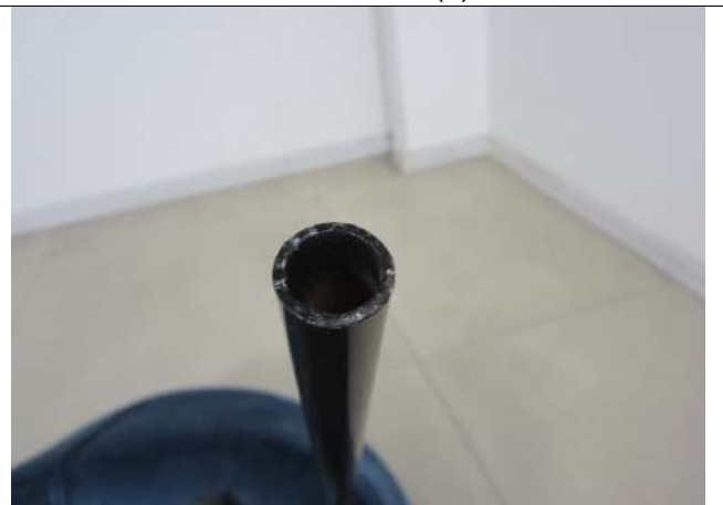
Item CH2156A (10)