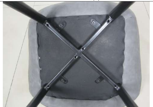
Item CH2152A (8)