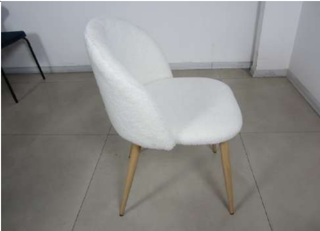
Item CH2164 (3)