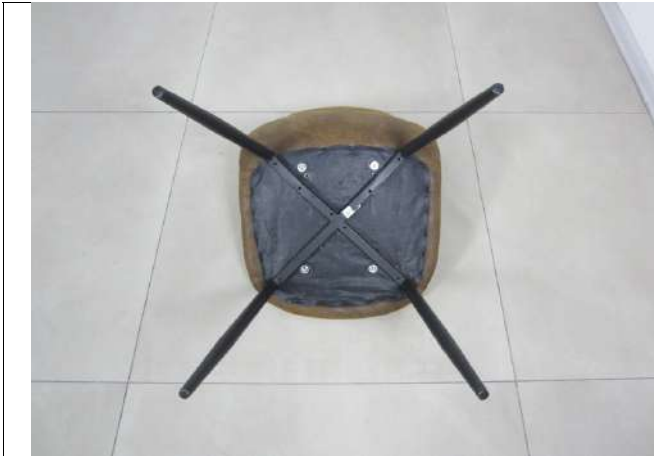
Item CH2163 (7)