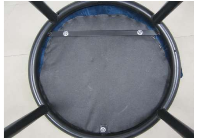
Item CH2161A (8)