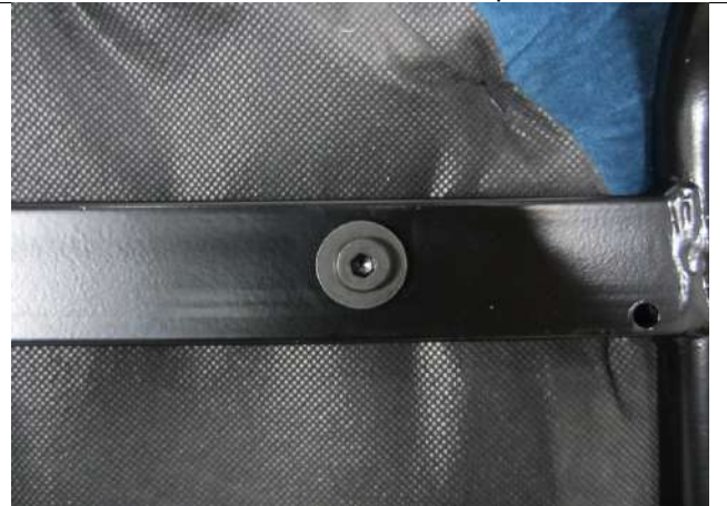
Item CH2156A (8)