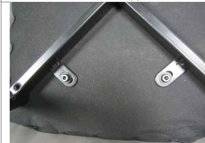
Item CH2152A (9)