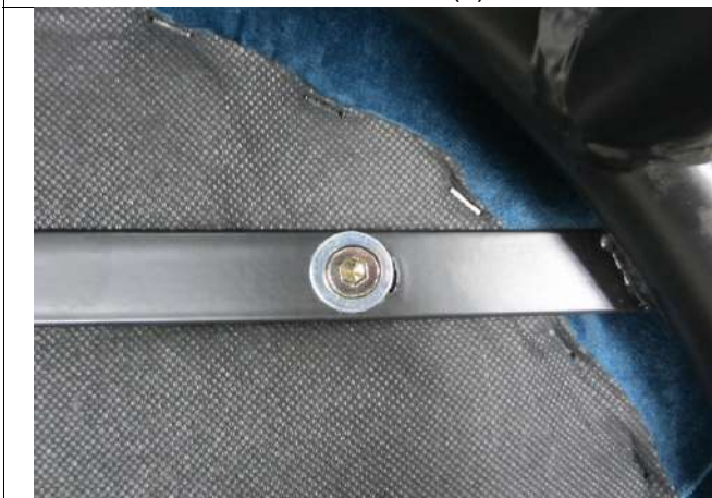
Item CH2161A (9)