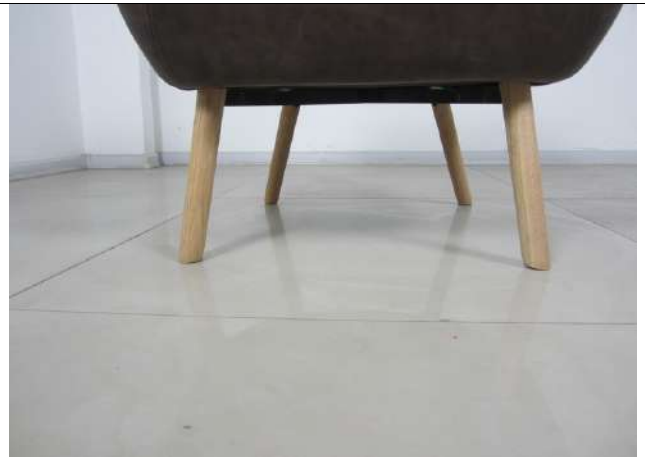
Item CH2151A (6)