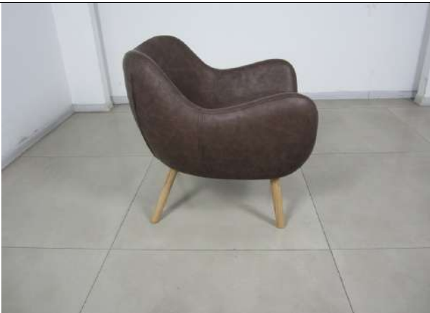
Item CH2151A (5)