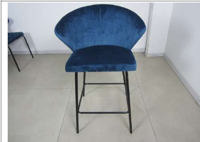
SAP1.2 Actually found