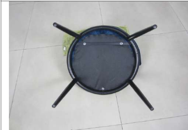
Item CH2161A (7)