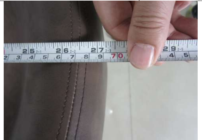
4 Product dimension check