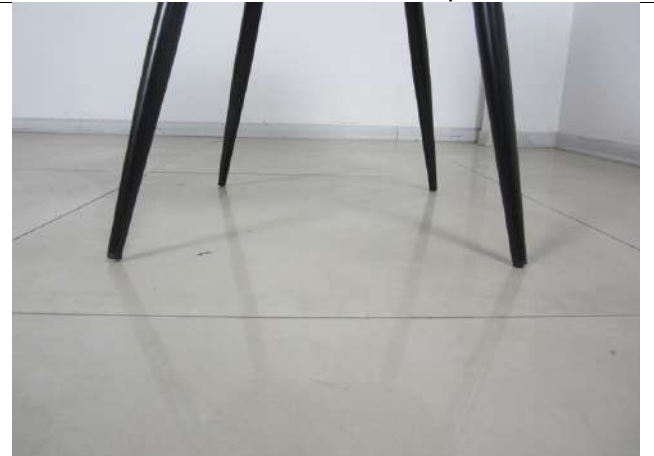
Item CH2152A (6)