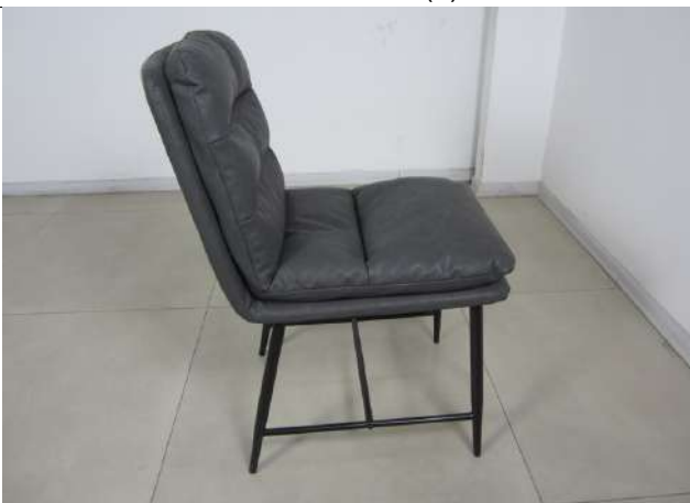
Item CH2154A (5)