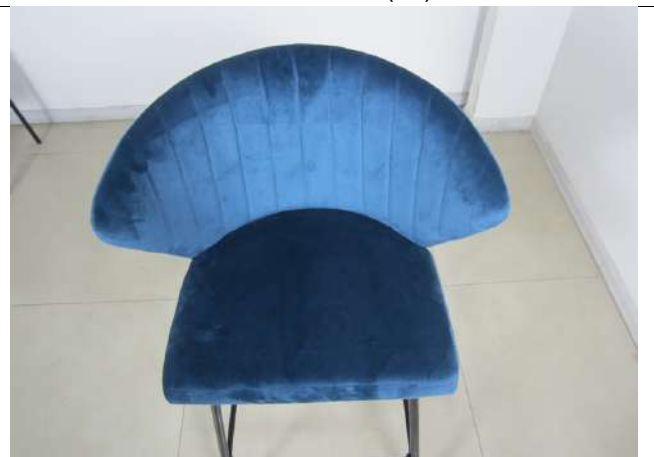
Item CH2157A (2)