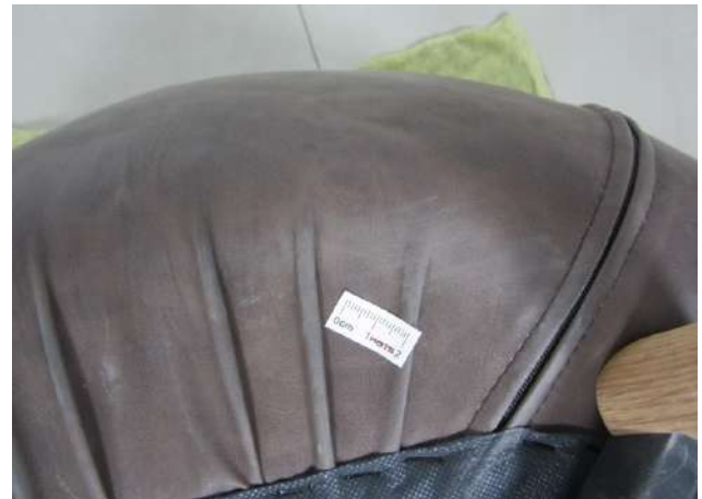
Defect- Item CH2151A-Broken on seat(3cm)+Dirty on surface(4cm)-Ma