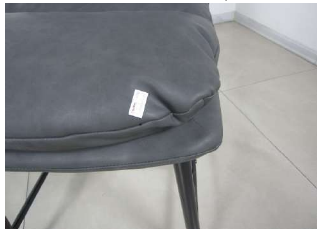
Defect- Item CH2154A-Wrinkle mark(3cm)+Chalk mark(1cm)-Ma