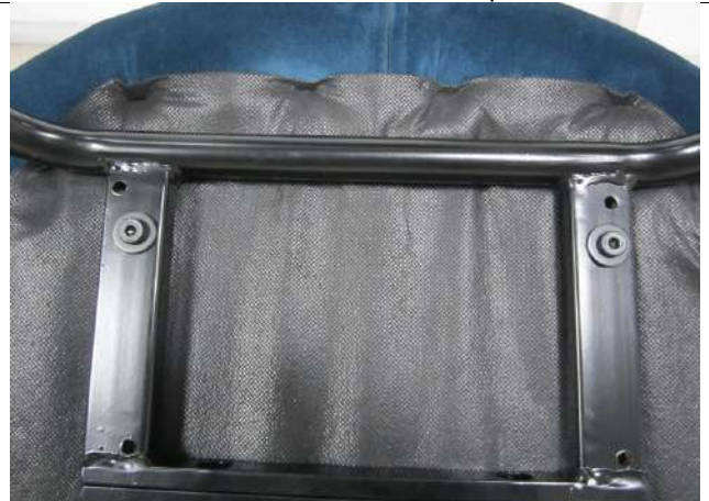
Item CH2157A (10)