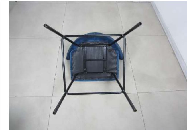
Item CH2157A (7)