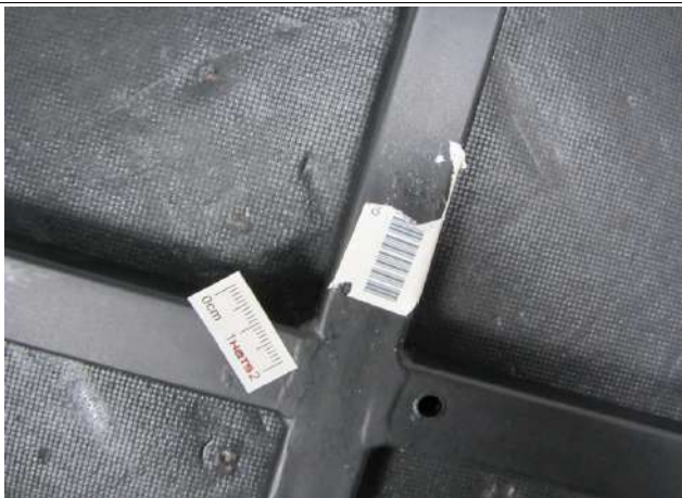
Defect- Item CH2163-Extra screw holes+extra sticker+Scratches mark on leg(2cm)-Ma