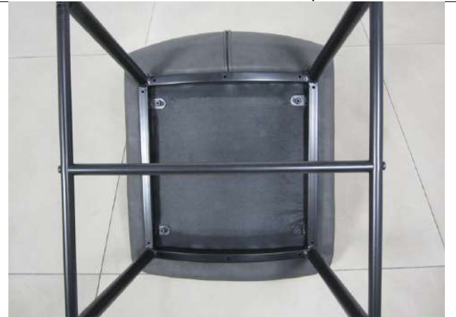
Item CH2154A (8)