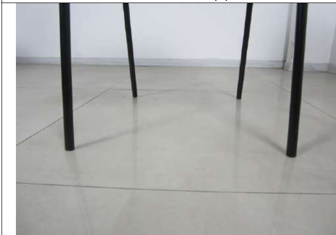
Item CH2156A (9)