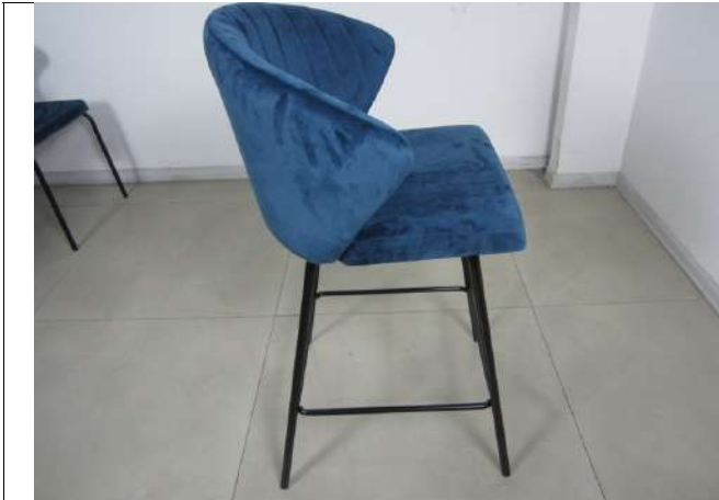
Item CH2157A (3)