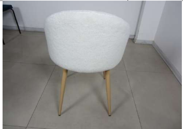
Item CH2164 (4)