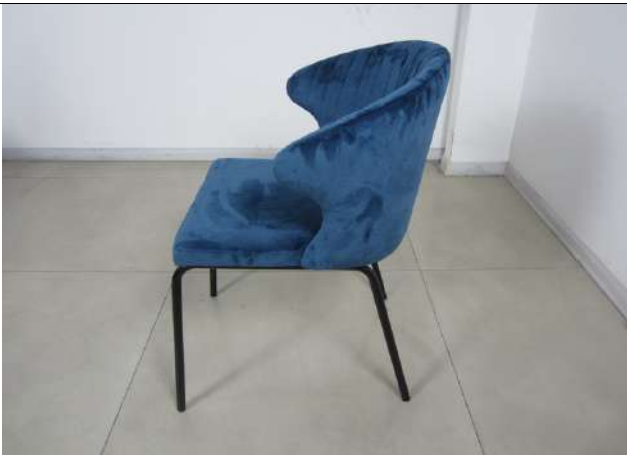
Item CH2156A (3)