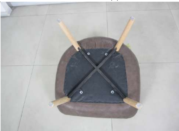
Item CH2151A (7)