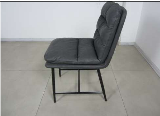
Item CH2154A (3)