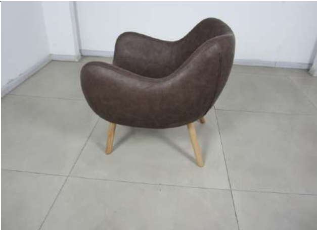
Item CH2151A (3)