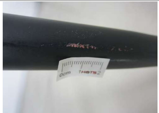
Defect- Item CH2163-Extra screw holes+extra sticker+Scratches mark on leg(2cm)-Ma