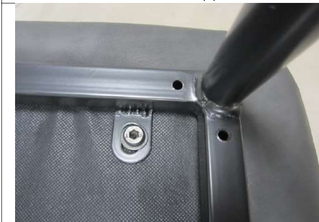
Item CH2154A (11)