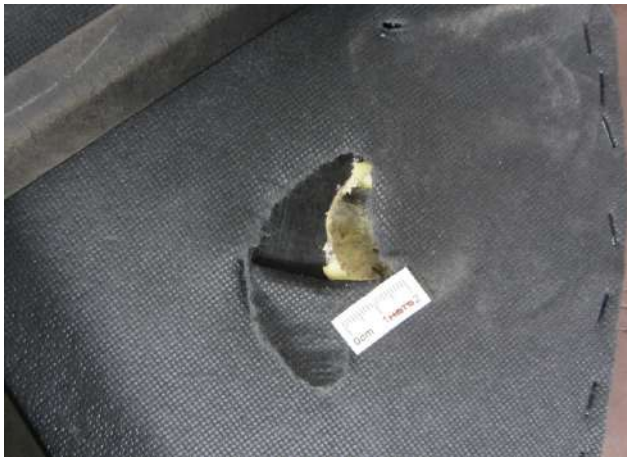
Defect- Item CH2151A-Broken on seat(3cm)+Dirty on surface(4cm)-Ma