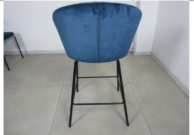
Item CH2157A (4)