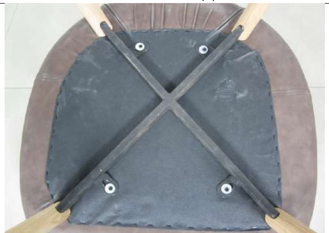
Item CH2151A (8)