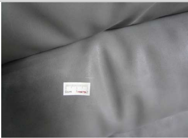
Defect- Item CH2154A-Wrinkle mark(3cm)+Chalk mark(1cm)-Ma