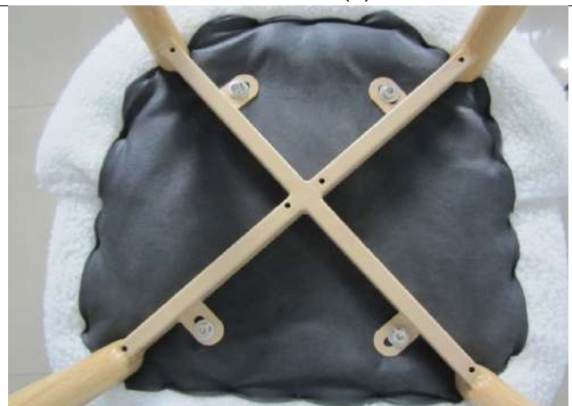
Item CH2164 (8)