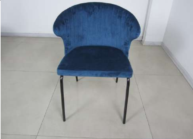
Item CH2156A (1)