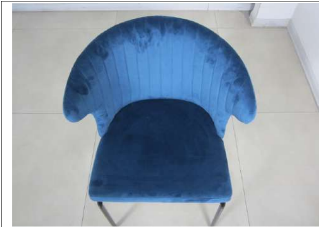
SAP1.1 Actually found