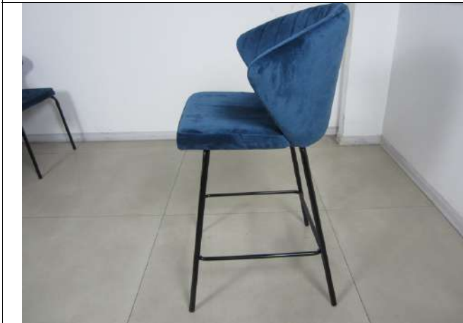
Item CH2157A (5)