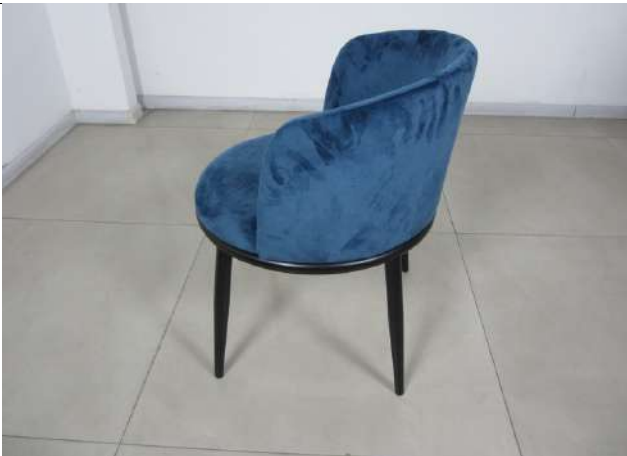
Item CH2161A (3)