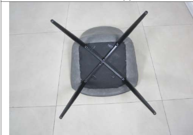
Item CH2152A (7)