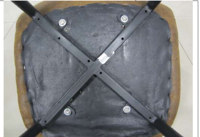
Item CH2163 (8)