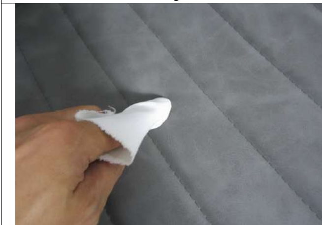
13 Rub test