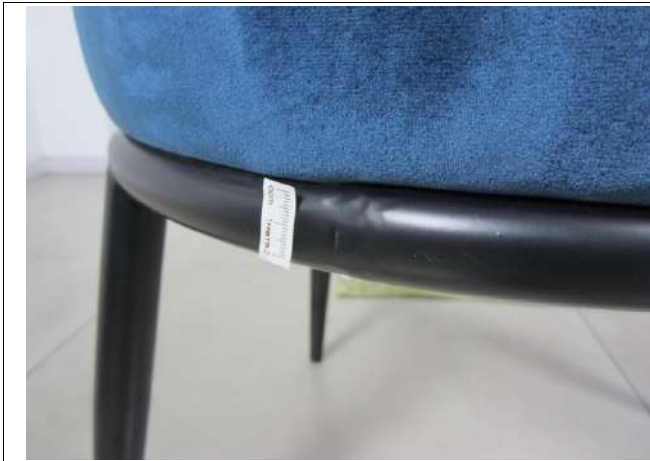
Defect- Item CH2161A-Uneven on iron tube(2cm)-Ma