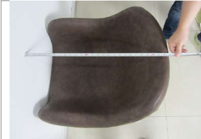
3 Product dimension check