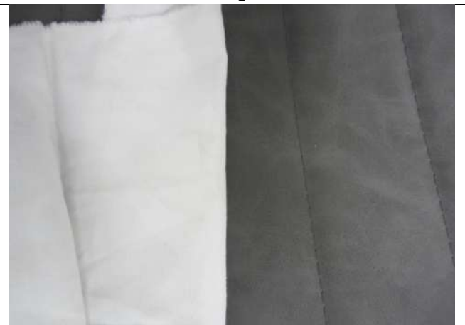
14 Rub test