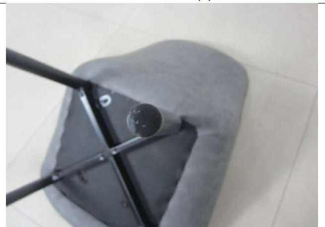
Item CH2152A (10)