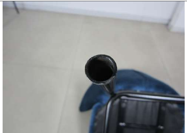
Item CH2157A (12)