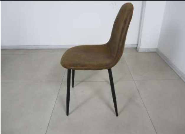
Item CH2163 (3)