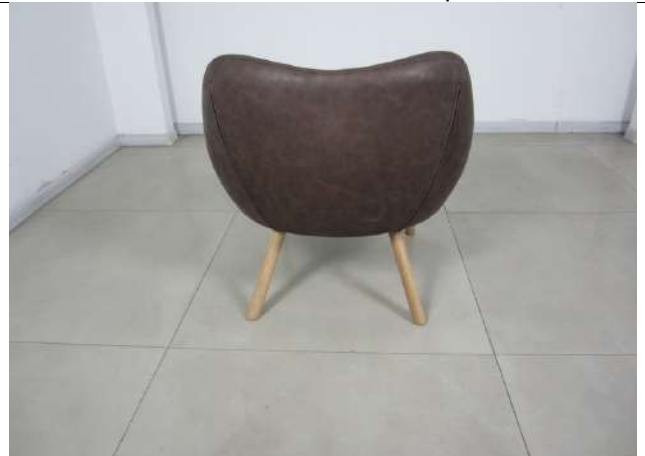
Item CH2151A (4)