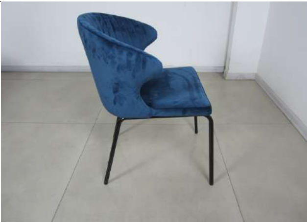
Item CH2156A (5)