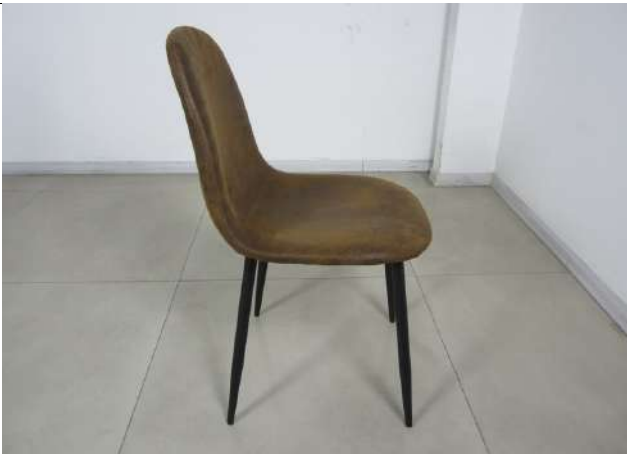
Item CH2163 (5)