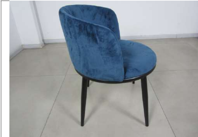
Item CH2161A (5)