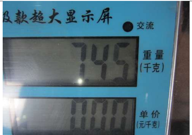
2 Product weight check