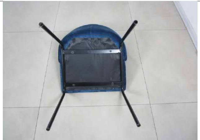
Item CH2156A (6)