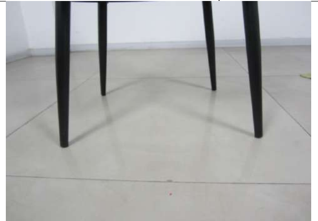
Item CH2161A (6)