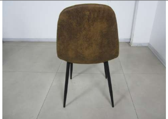
Item CH2163 (4)