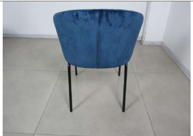
Item CH2156A (4)