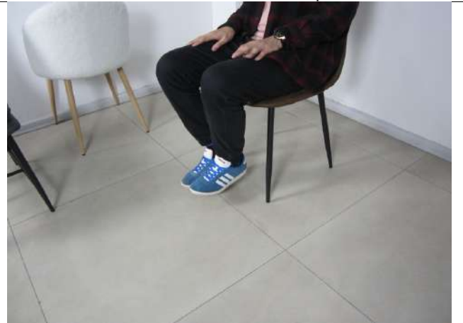
16 Real function operating check