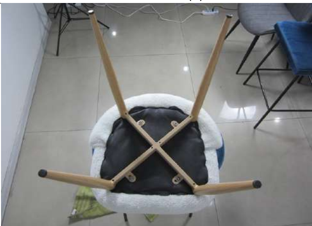
Item CH2164 (7)