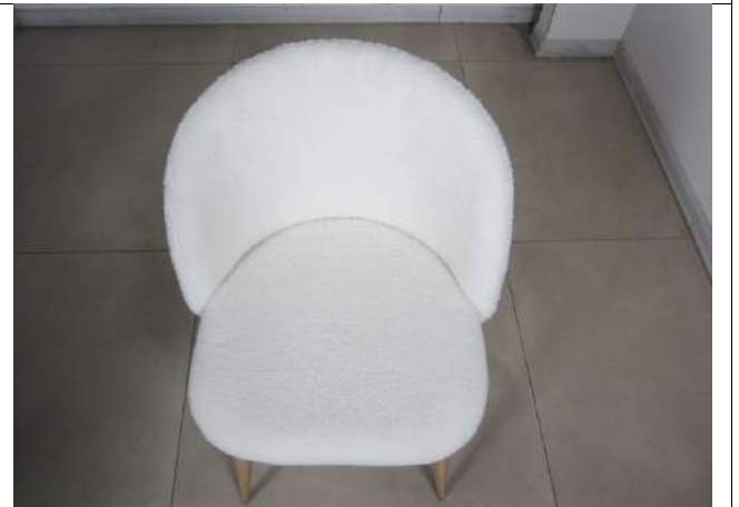
Item CH2164 (2)