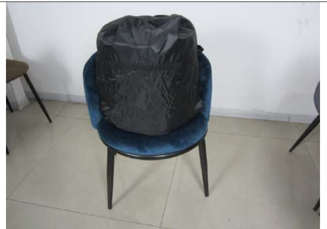
12 Loading check