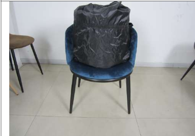
11 Loading check