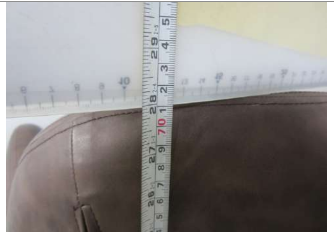
6 Product dimension check