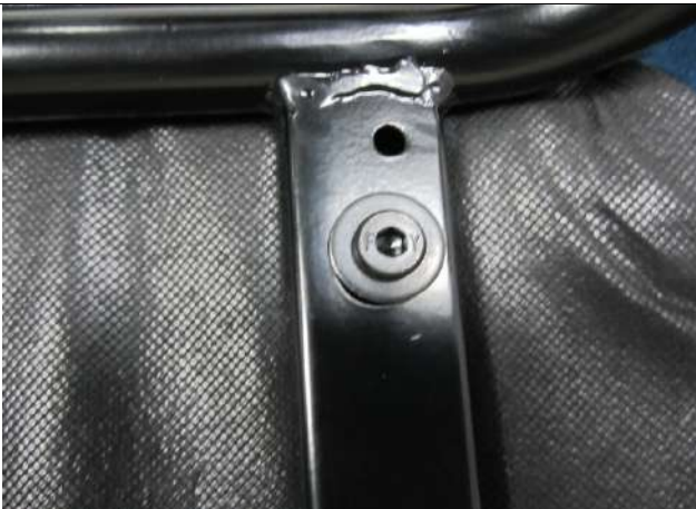
Item CH2157A (11)