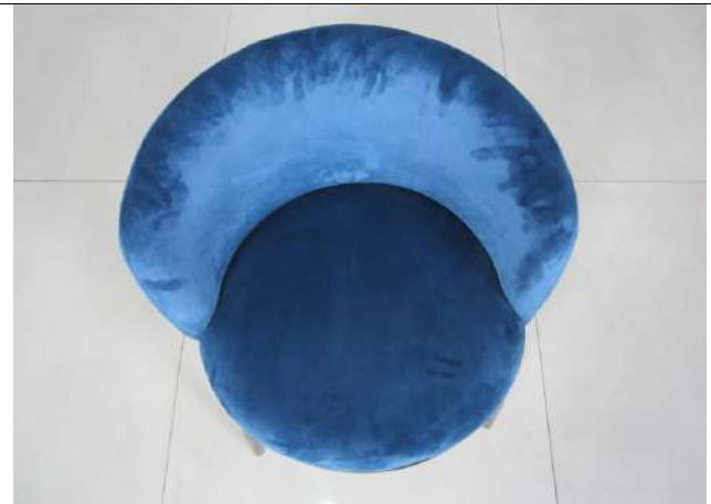
Item CH2161A (2)