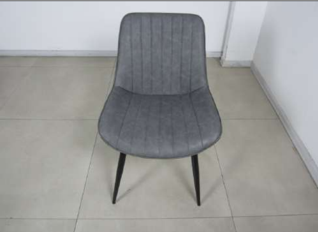
Item CH2152A (1)