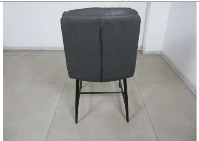
Item CH2154A (4)