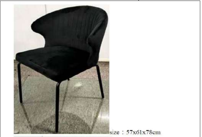
SAP1.1 On SPEC